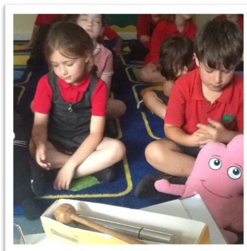
Pupils making use of the Jigsaw teaching aide we funded for Beech Hyde school.